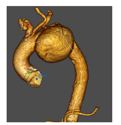
Figure A. Pre-operative 3-D reconstruction shows large arch aneurysm